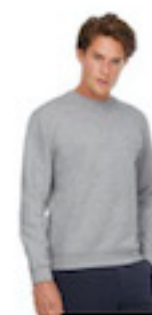
EXISTS IN UNISEX: B&C SET IN