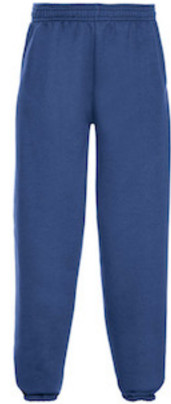
750B Children's Sweat Pants SIZE 3-12 YEARS

MATERIAL: 50% Combed Ringspun Cotton; 50% Polyester